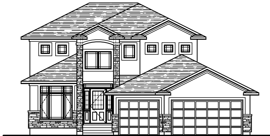
1 FRONT ELEVATION