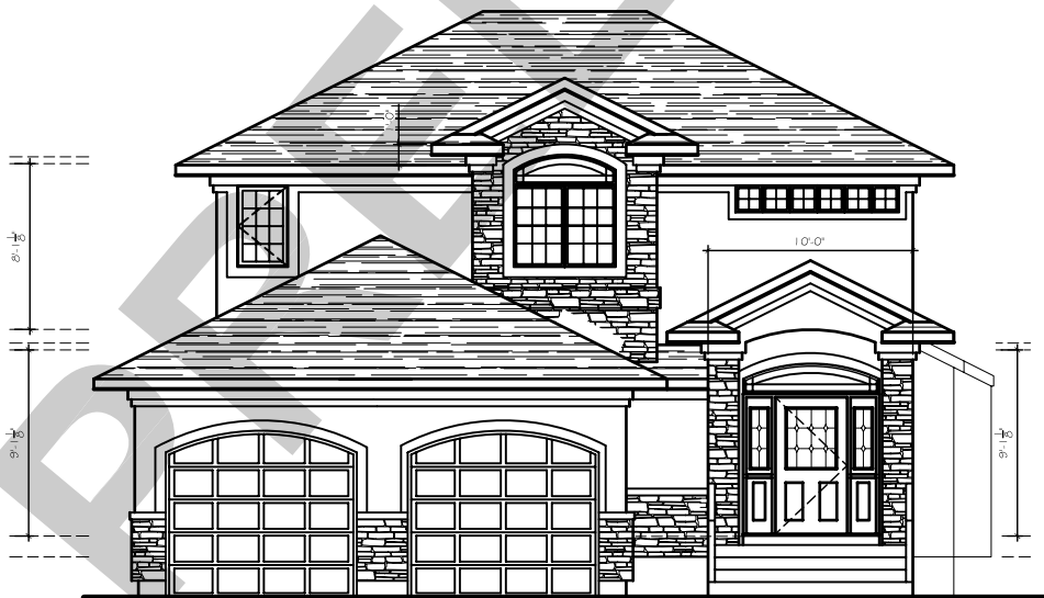
3 FRONT ELEVATION NTS